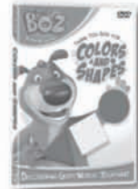
Colors and Shapes UPC 8-52857-00101-9