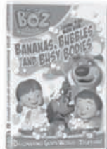
Bananas, Bubbles and Busy Bodies UPC 8-52857-00104-0