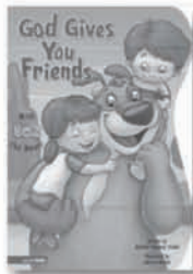
God Gives You Friends ISBN 0310711533