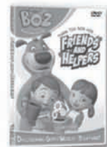
Friends and Helpers UPC 8-52857-00102-6