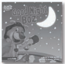
Good Night, BOZ ISBN 0310712068